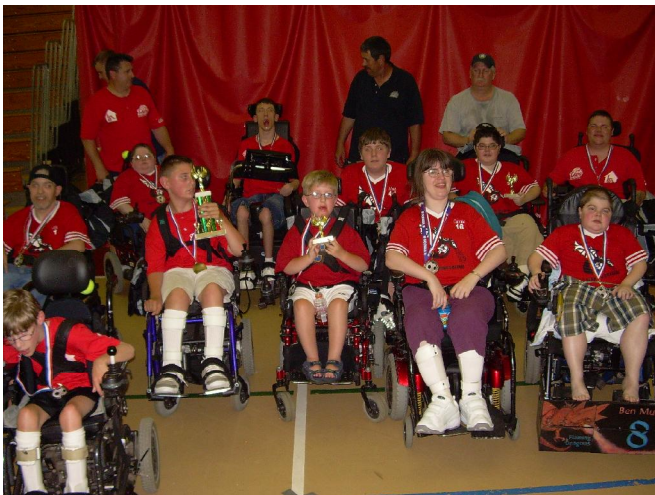
Our Division 2 team wins the trophy at the Auburn, NY Tournament, held in June.