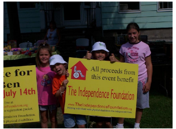
The Stoffel Family at their Garage Sale to help The Independence Foundation!